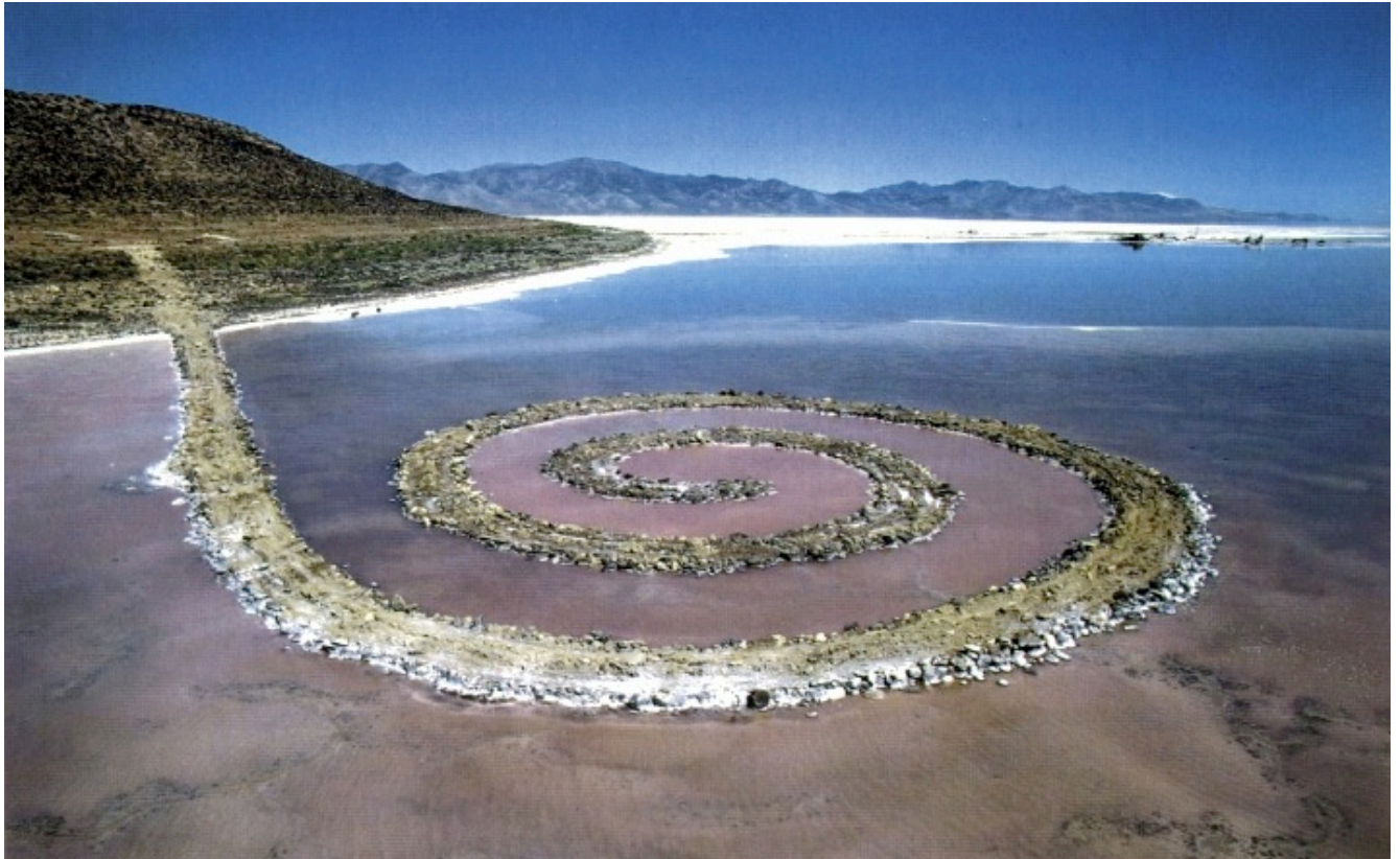
Robert Smithson, Spiral Jetty (Great Salt Lake, Utah), 1970 (Smithson 1970).