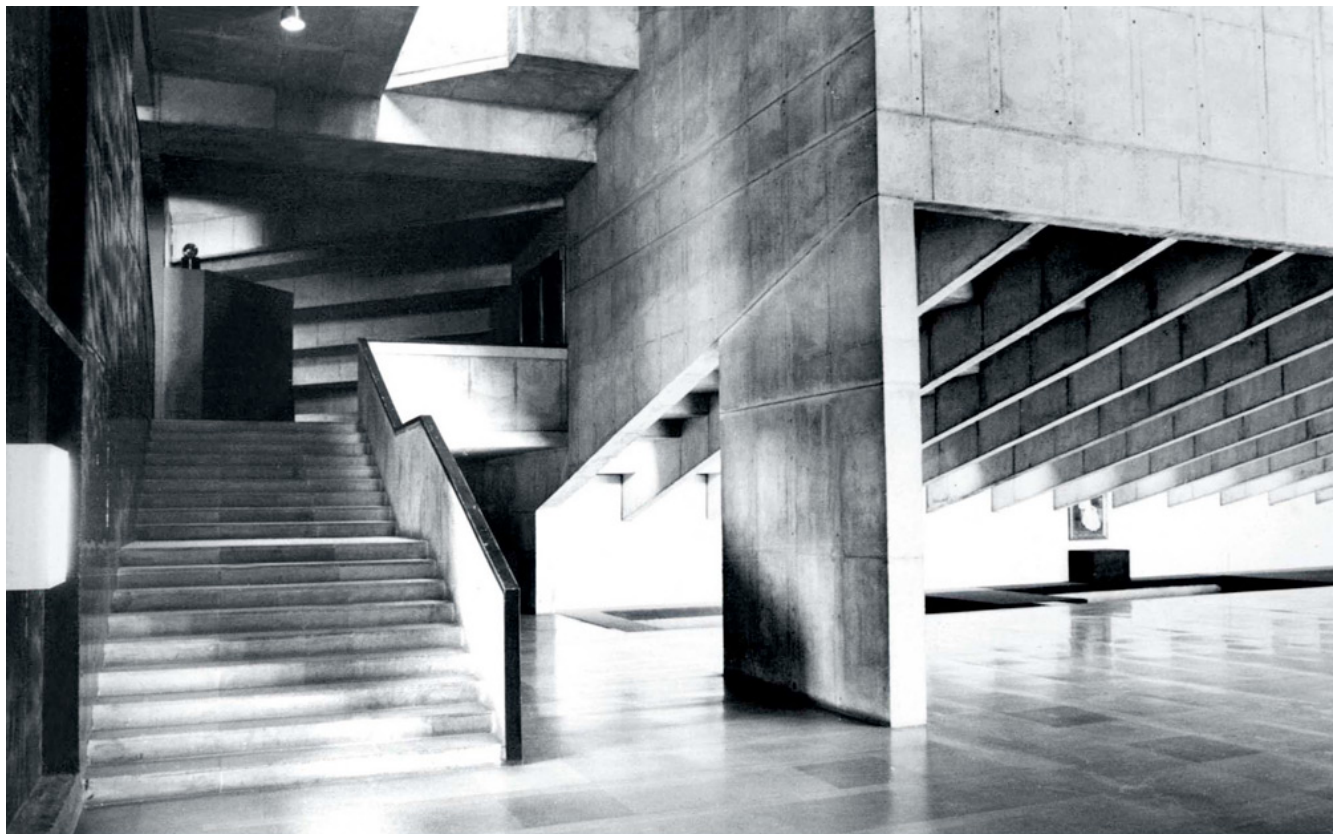
Premabhai Hall in Ahmedabad, Gujarat. Designed by Balkrishna Doshi in 1956 (see "Balkrishna Doshi" 2018).

Our discussions in class will also help prepare you to develop arguments about cultural theory and its application to ethnographic analysis. Your first major assignment is an essay of 1500 words in which you compare two of the major theories of culture we have read. This will be due before the midsemester break. Your other major assignment is to write an essay discussing the connections between your thesis topic and the history of debates about nature and culture. This will be due at the end of the semester.